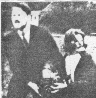
THE WAR GAME

LA JETEE (THE JETTY) France/1963 Directed, written and produced by Chris Marker. In this acclaimed French short, a haunted survivor of World War 3, living in subterranean Paris, journeys into the past in search of a fleeting memory. Perhaps the greatest time-travel film of the 1960's, the entire film consists of still images accompanied by voice over narration. Marker explores the link between memory, time and vision. In French with English subtitles. 27 minutes.