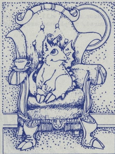
"Gargoyle Hoping For Raspberry Teacakes"

ConSuite will run from 6 pm to midnight on Thursday, and Video will also be going. Full programming begins on Friday.