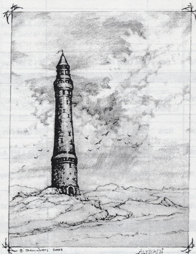
ATTARAIN TOWER ATTARAIN - TYRAN